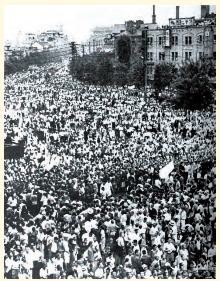
Thousands of Seoul citizen fill the road from Seoul railroad station plaza to Namdaemun (the Great South Gate of the city, just visible in the background) on August 16, 1945

Because of the Fall, which occurred on the family-level, and at the top of the growth stage, from the providential, historical point