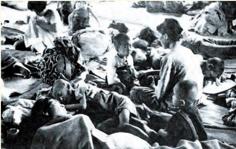
Japanese refugees in a detention camp in Korea awaiting their repatriation during the chaos following Japan's defeat in World War II

said, "The Japanese have lost the war and are really in a wretched state. God will punish those who beat people; they have lost sovereignty over Korea and are begging on bended knee for forgiveness." I also quietly called some Japanese who was being pursued in Korea and helped them pack their bags saying, "Go home quickly, before you are tortured." Nineteen forty-five was a very happy year for the Koreans, but it wasn't for the Japanese, who had lost the war; for them it was a sad year. We need a day on which all the people of