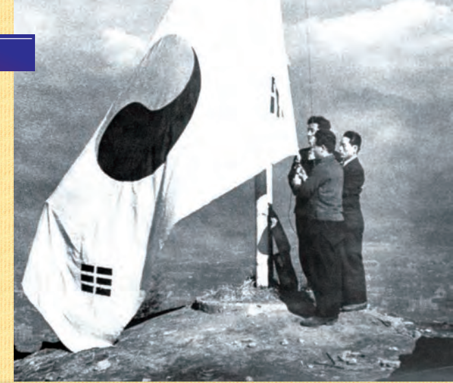
The Korean flag is raised atop Namsan, a hill in the center of Seoul, celebrating Korea's newly won independence

3 The Korean Provisional Government (KPG) had been based in China; Kim Ku had led the KPG but also had his own following.