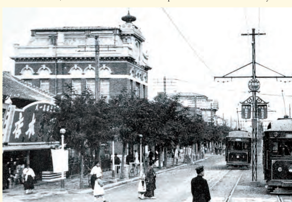
A view of Pyongyang, now capital city of North Korea, during the latter part of Japanese rule. In those days, Pyongyang was a such a center of Christian activity, with numerous churches, that Christians called it the Jerusalem of the East.

I used to pray, "How many people are here that God can use? In the Bible, it says that Sodom and Gomorrah could have been saved if there had been only five righteous men; how many people might be called righteous? If there aren't any, please wait a few months, I will raise such people." You can imagine how busy I was. TW